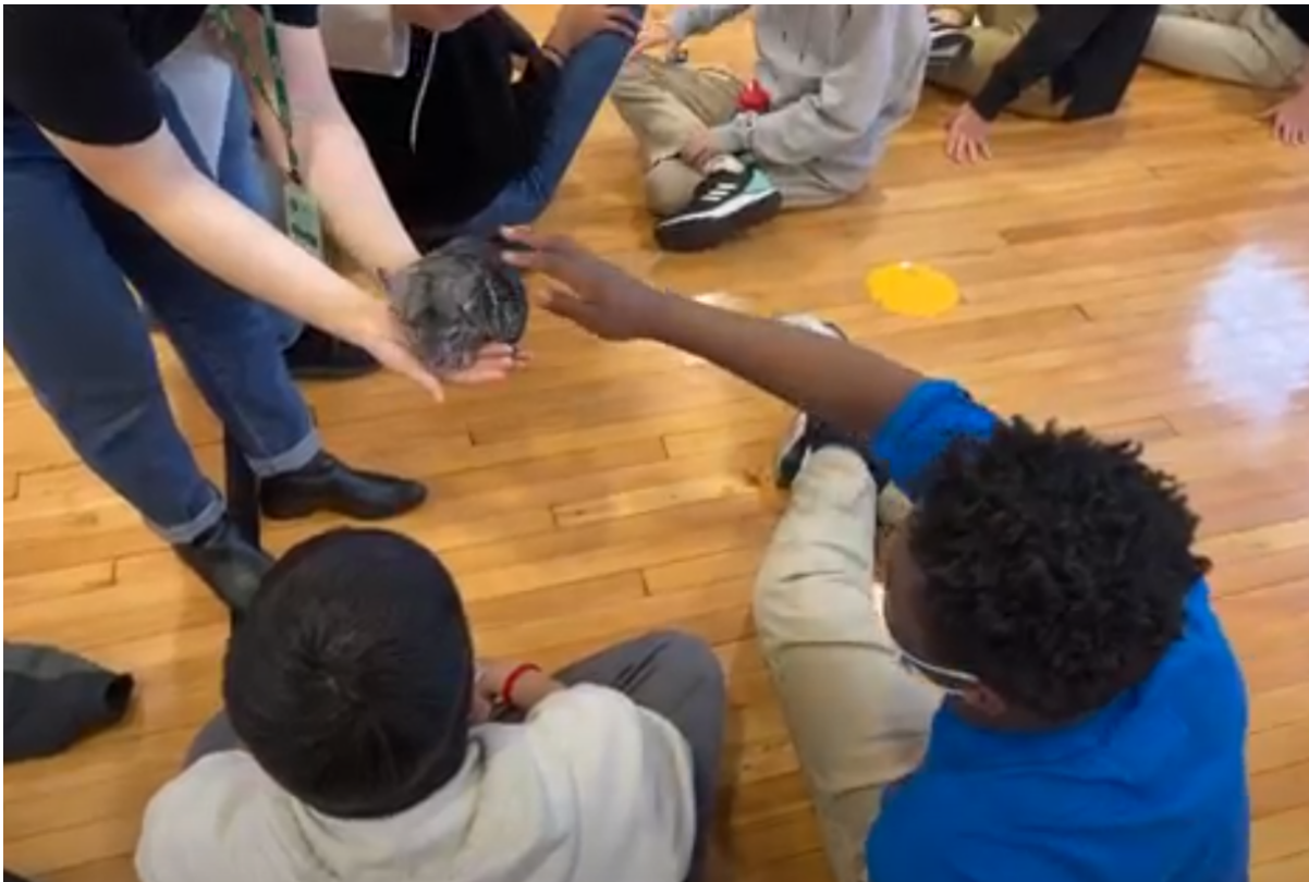
Students getting a chance to pet a chinchilla.