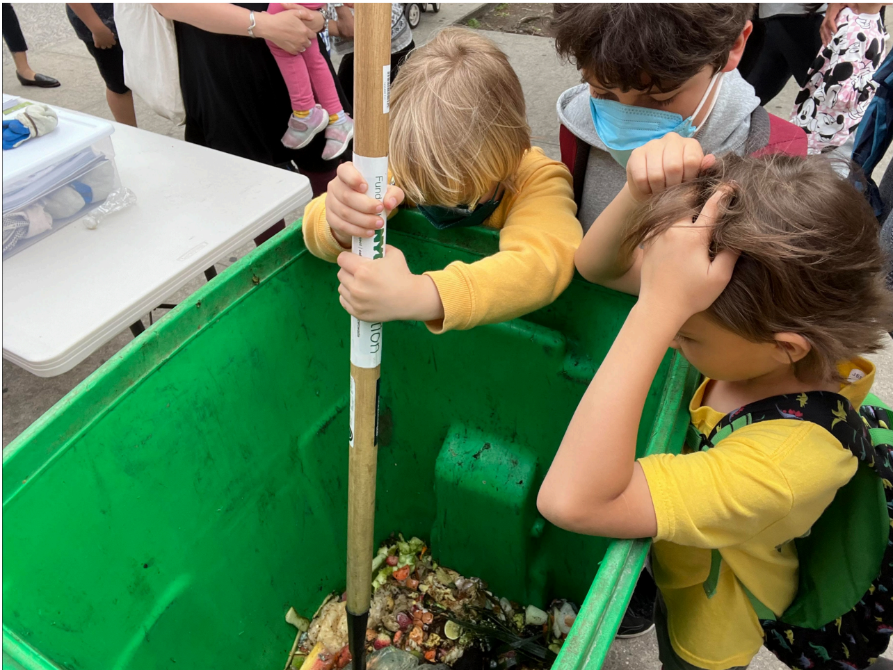
Q300 students getting in on the action to aerate and mix different types of food scraps.

What's a great thing to do with food items that are going into the trash instead of sending them to the landfill to release greenhouse gases? Compost them!