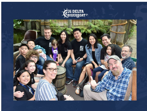
Chess Team families enjoying time together in Nashville.

If you would like to join, or have any questions, please email us at q300chessteam@gmail.com .