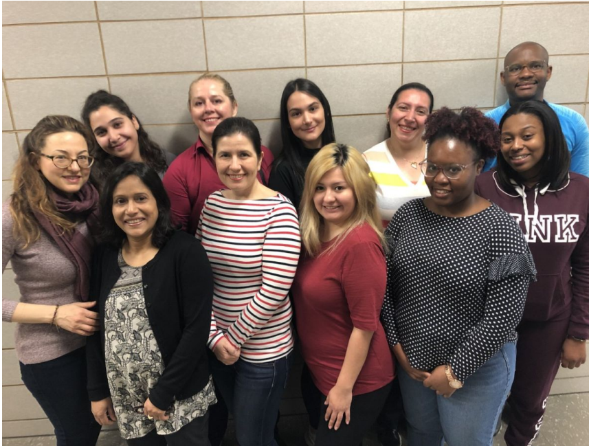
Lower Division Paraprofessionals and Teaching Assistants