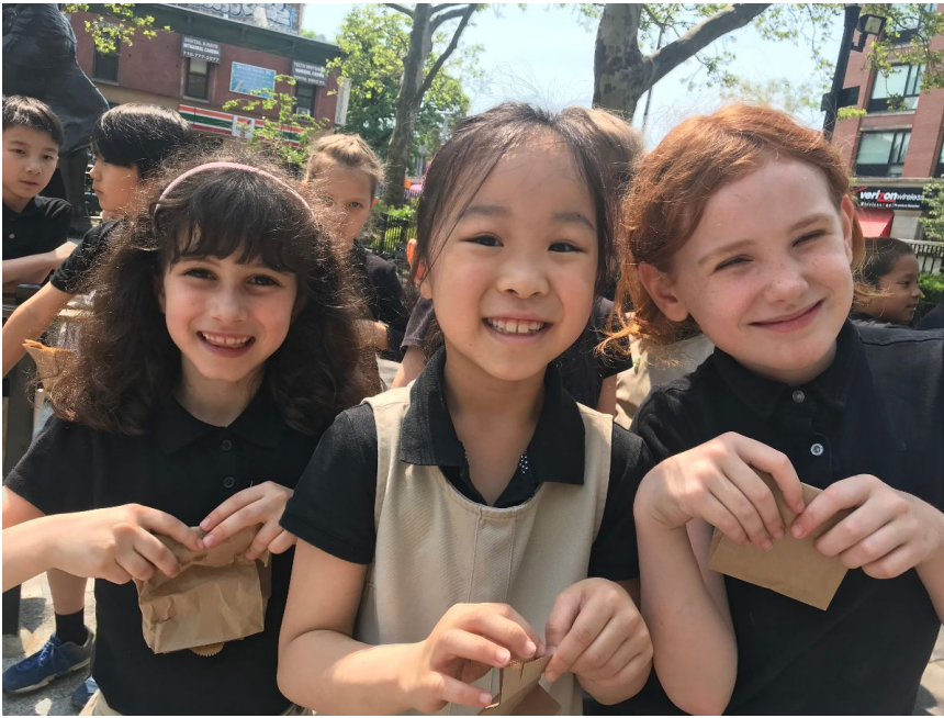
Q300 gives Athens Square Park some TLC.

On May 31, Q300's Lower Division showed its appreciation for our neighboring Athens Square Park and the street trees surrounding the school by devoting the day to caring for them.