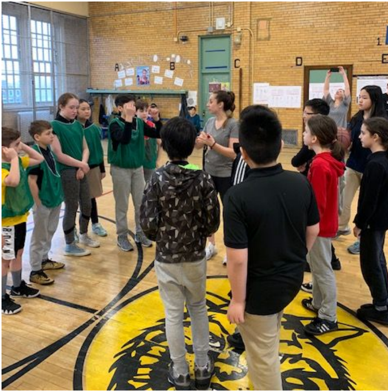
Students get geared up for Q300's basketball tournament.