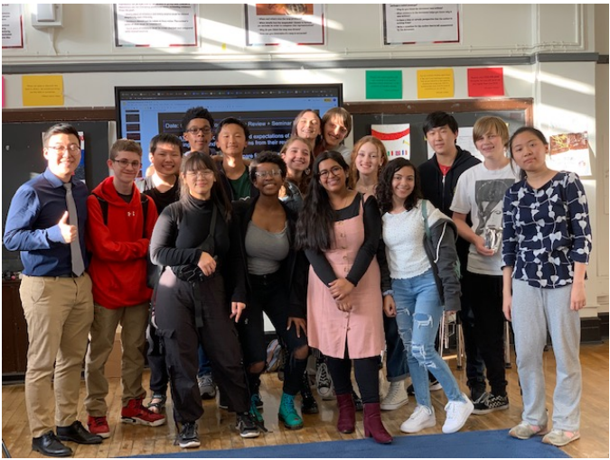
Q300 is proud of its alumni family!