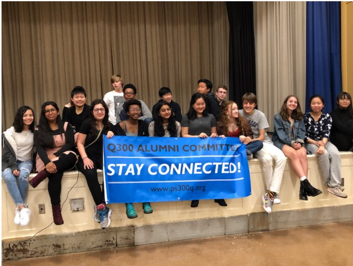
Q300 Alumni visit Upper Division students in May.

A panel of Q300 graduates returned to the school last month to offer advice to current students. Their message: it's all about balance. Challenge yourself, but don't burn yourself out. Join lots of clubs, but be ready to drop those that are not a good fit. Be open to new friendships, but avoid bad influences.