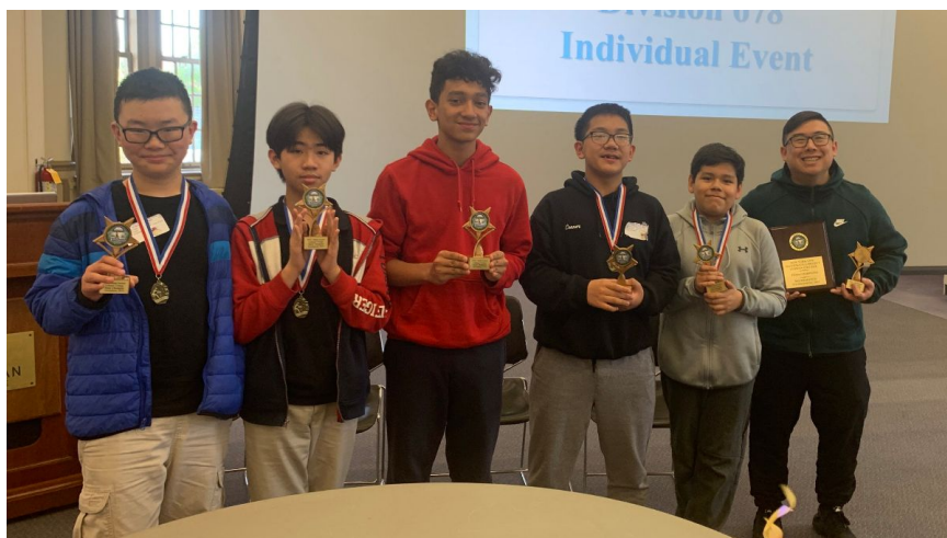
NYC Math Project